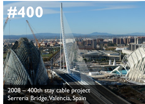
#400 2008 – 400th stay cable project Serreria Bridge, Valencia, Spain