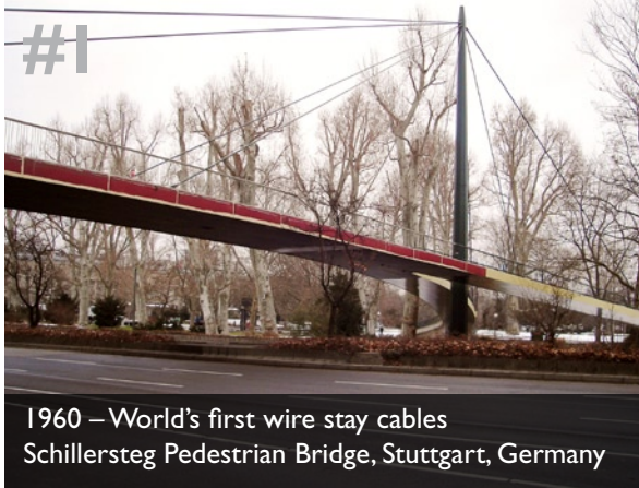
#1 1960 – World's first wire stay cables Schillersteg Pedestrian Bridge, Stuttgart, Germany