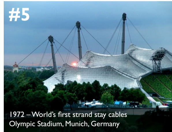
#5 1972 – World's first strand stay cables Olympic Stadium, Munich, Germany