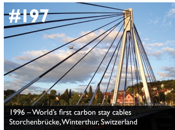
#197 1996 – World's first carbon stay cables Storchenbrücke, Winterthur, Switzerland