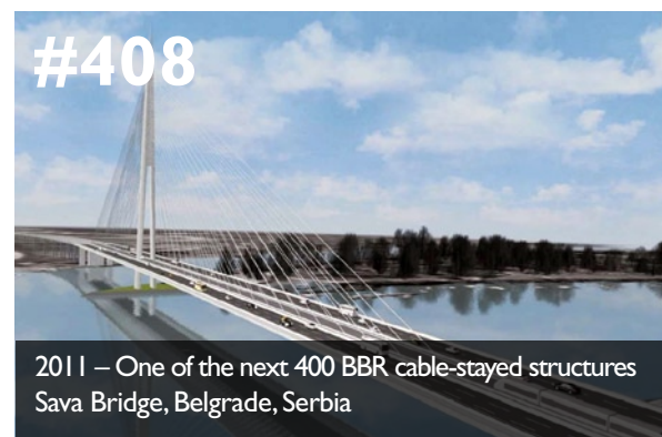
#408 2011 – One of the next 400 BBR cable-stayed structures Sava Bridge, Belgrade, Serbia